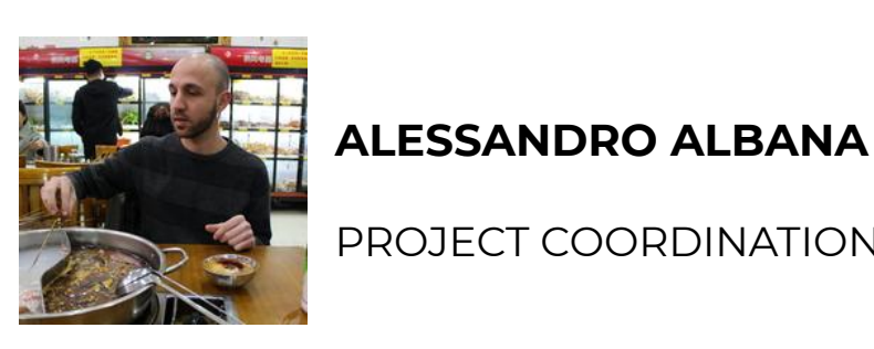
PROJECT COORDINATION TEAM